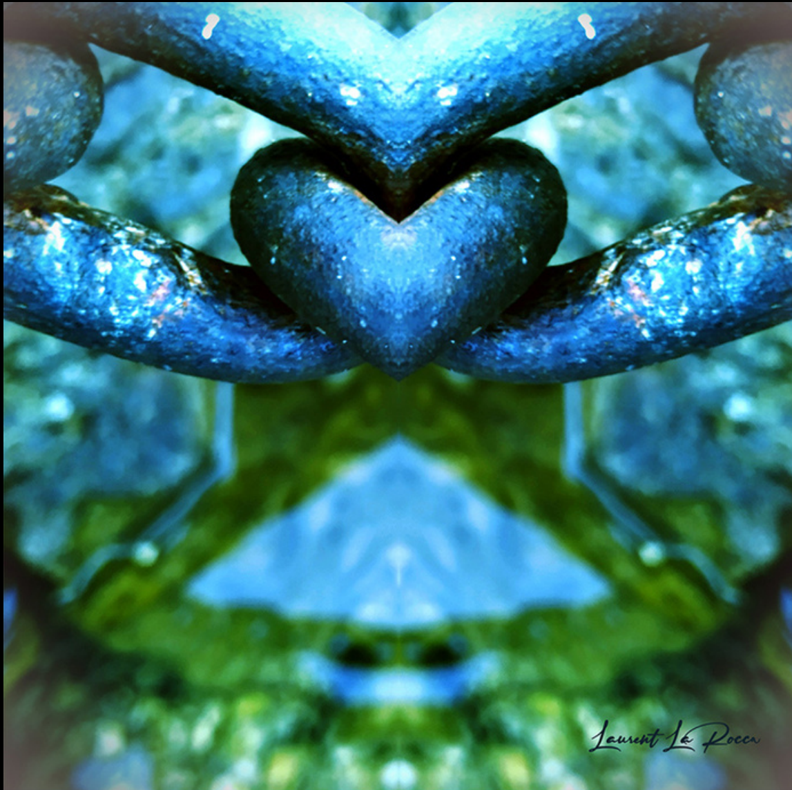
Crazy love (2020)

These photographs are created using boat chains, a symbol of strength. The links illustrate the stages of life and the connections that bind people together.