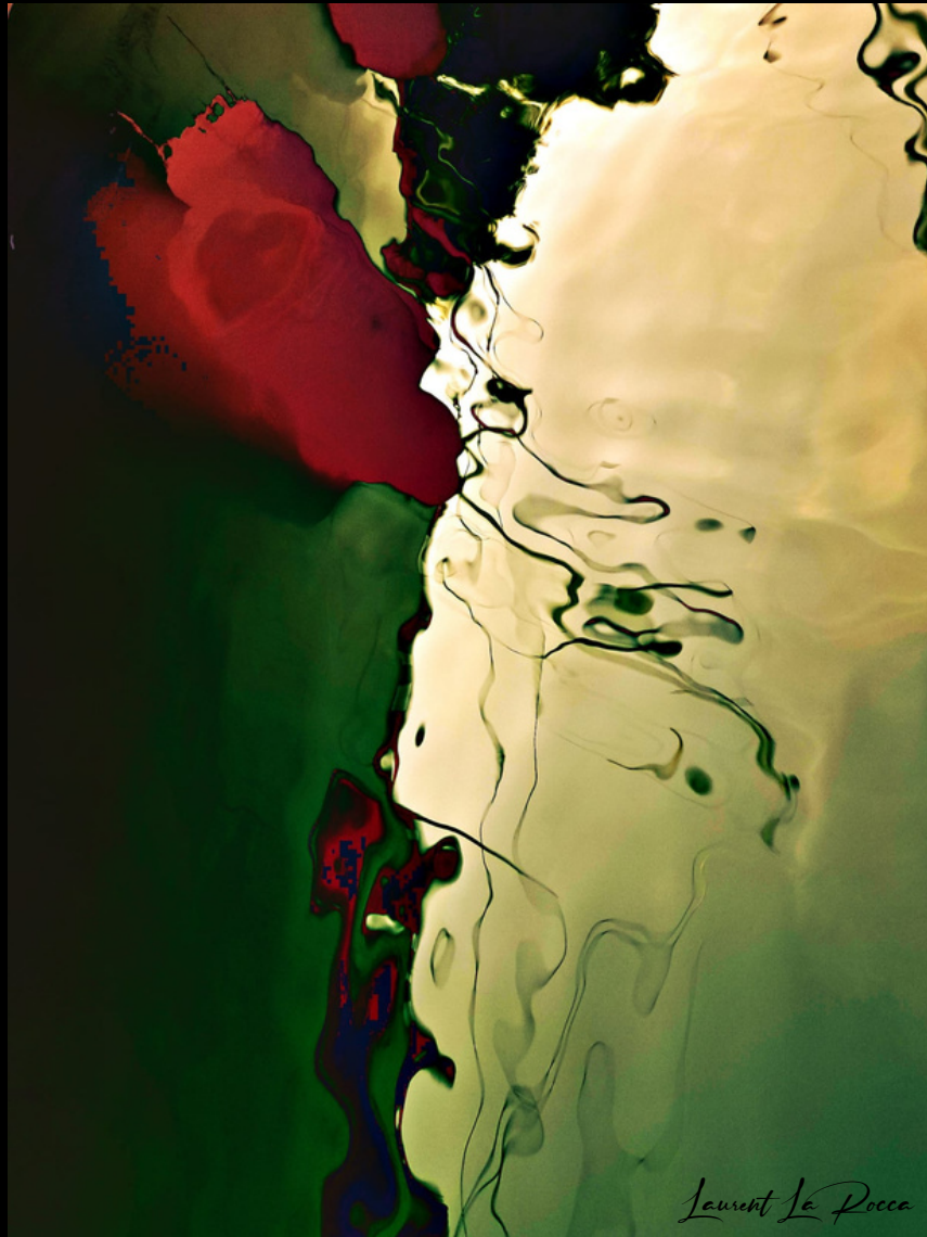
Enchanting reflection (2023)

The artist works on the constantly moving reflections of water and thus offers a transformed vision of reality.