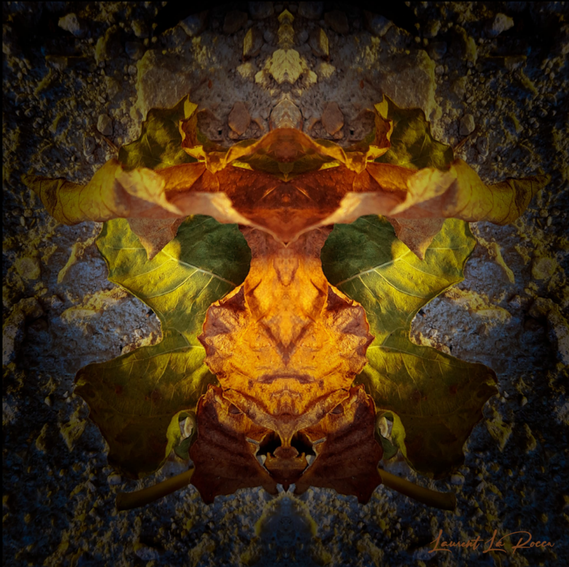
Laurent La Rocca The distracted (2022)

This collection of photographs, created with a mirror effect, is an invitation to immerse oneself in a fantastical world and encounter other forms of life inhabiting the universe: the Creatures.