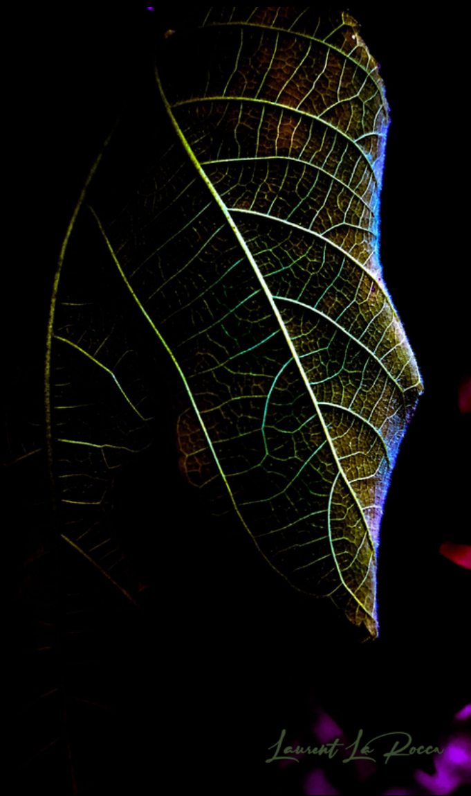
Her most beautiful profile (2022)

Let's delve into optical illusions with this series of photographs: pareidolias take the spotlight.